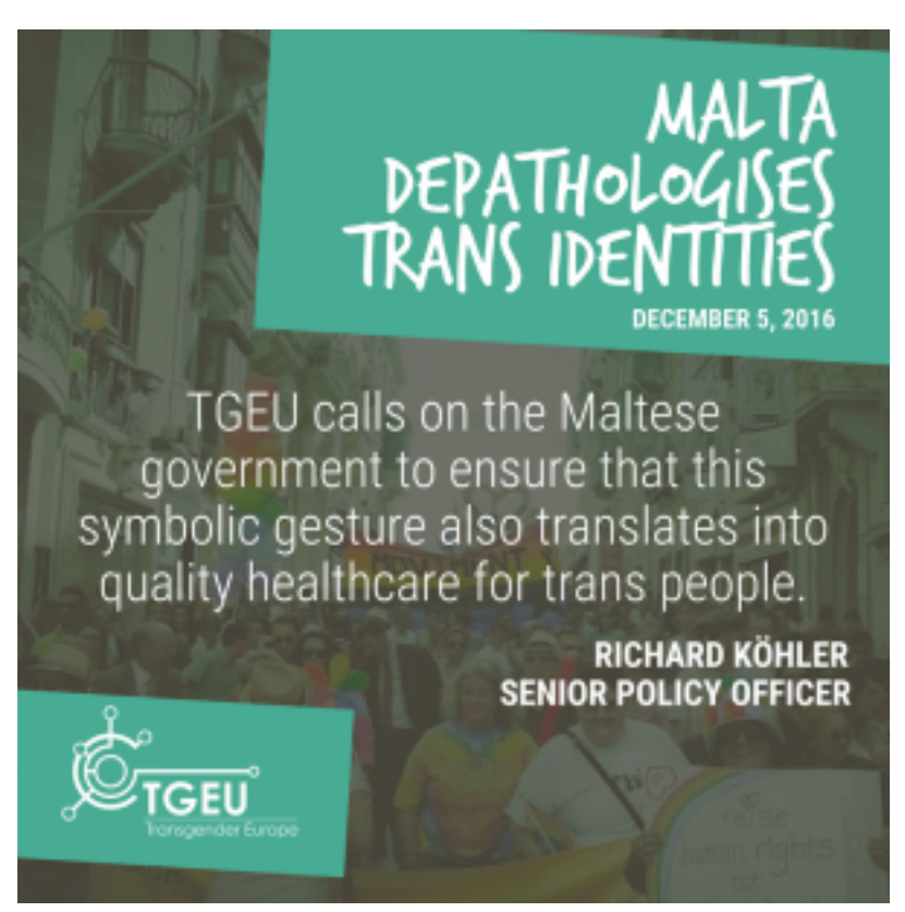
Timeline of Malta's protection of trans rights